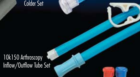
10k150 Arthroscopy Inflow/Outflow Tube Set